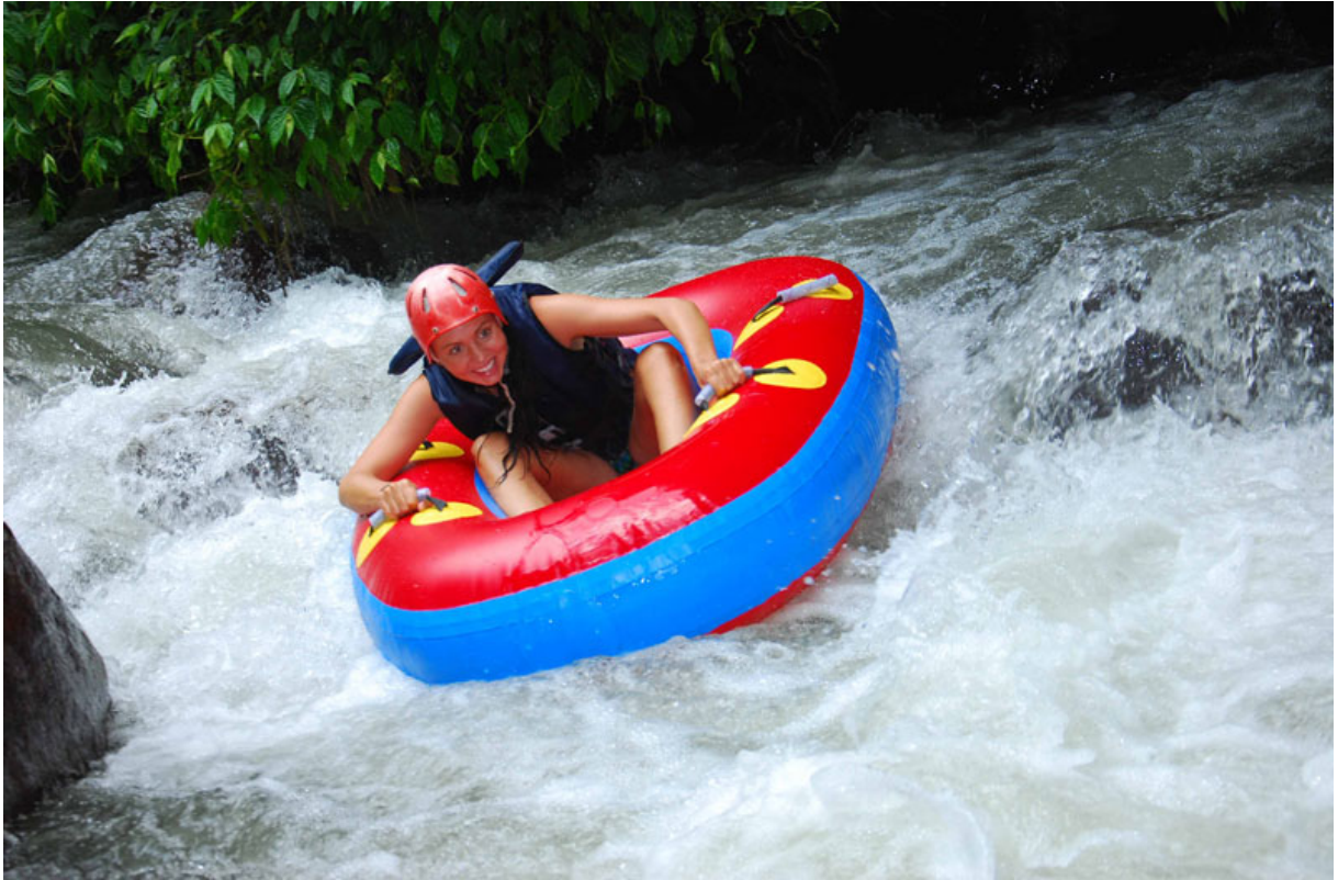
Tubing Adventure Bali

Tubing is another adventure that done on river route and use a smaller inflatable boat to navigate. The boat has a donut-like shape and is only boarded by one – two persons without holding a paddle.