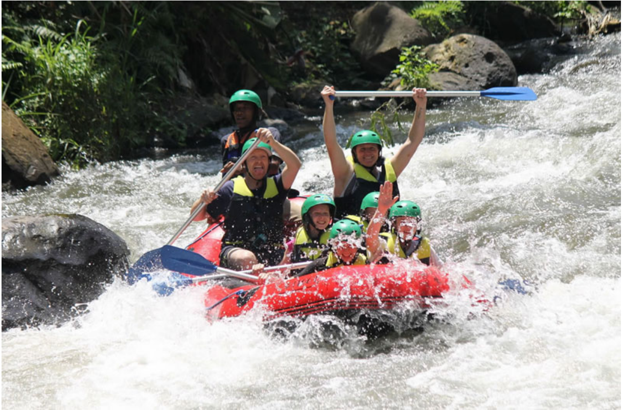
Ubud White Water Rafting Adventure

Rafting or also known white water rafting is an adventure that done on river route where you will navigate by boarding an inflatable boat and also paddling a kayak.