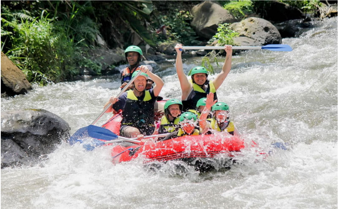
White Water Rafting Ubud

As atv riding, the rafting adventure also require all participants wear safety equipment (a helm and a life jacket) which is already provided at office of the spot.