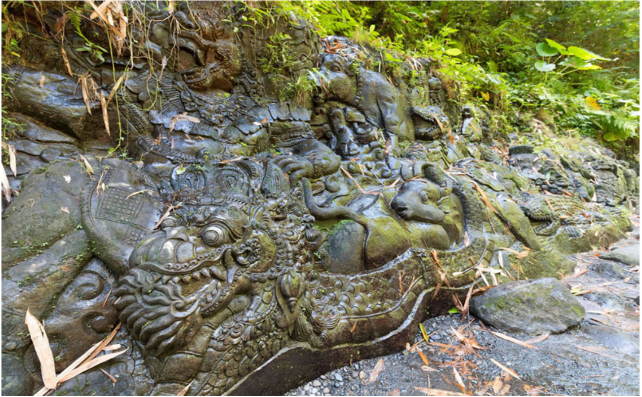
Stone Carving at Ayung River Ubud

Meanwhile, the existence of the stone carvings really make Ayung Spot become more special than others. It illustrated figures in Ramayana Story and was created by 50 local artists.