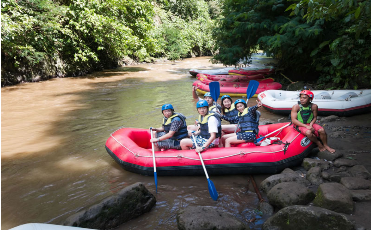
Bali White Water Rafting River

The rafting adventure is also as fun as atv riding. It will be done on Ayung River – Ubud (the most popular rafting spot in Bali Island) with has challenging river route (about 10 kilometers).