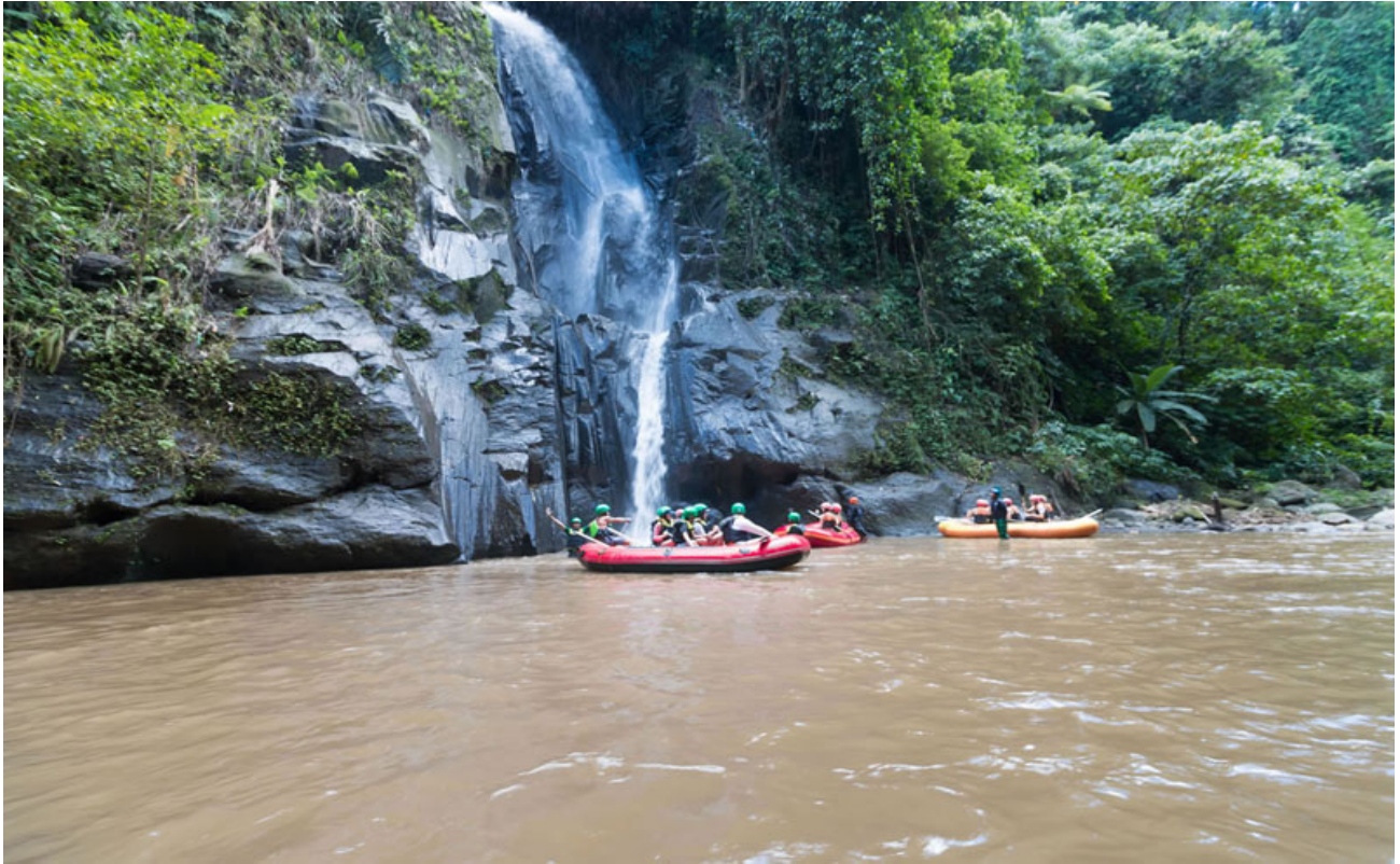
Waterfall at Ayung River Spot

One boat usually consist of 4 – 5 rafters with a guide. All participants also will hold a kayak to paddle during the rafting adventure.