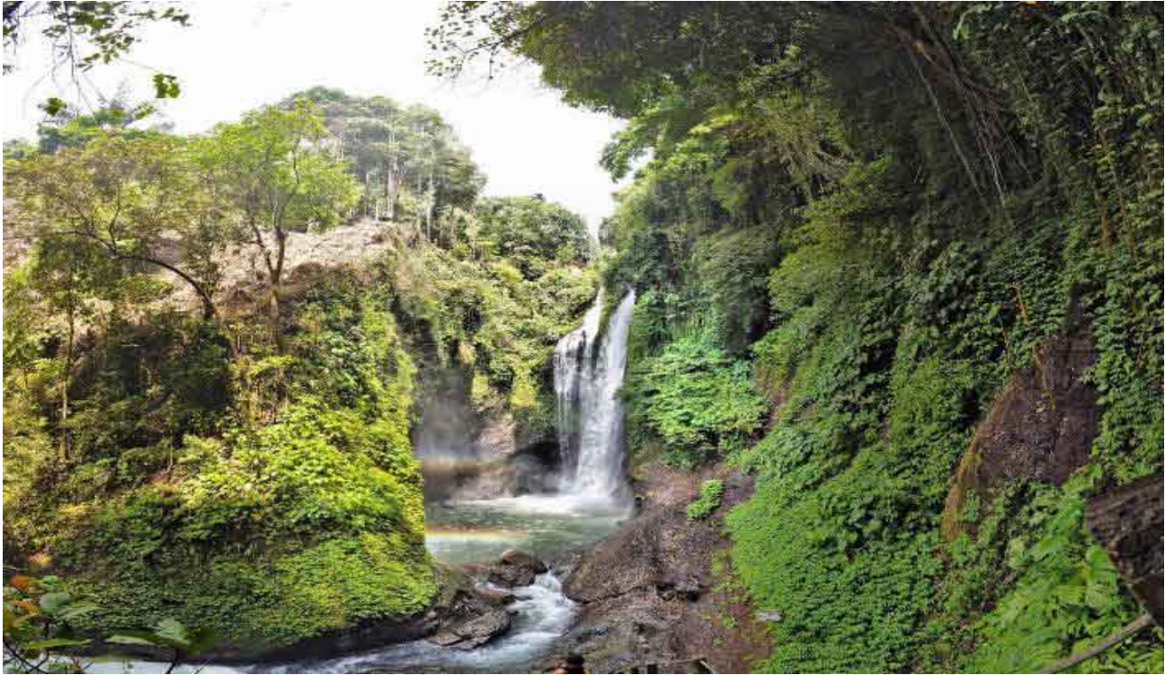
Aling Aling Waterfall

However, some people are also interested to visit by a reason of its cliff that be fit to get a few thrilling cliff jumps. This is really worthy to fill your holiday time in Bali to get much unforgettable moments.