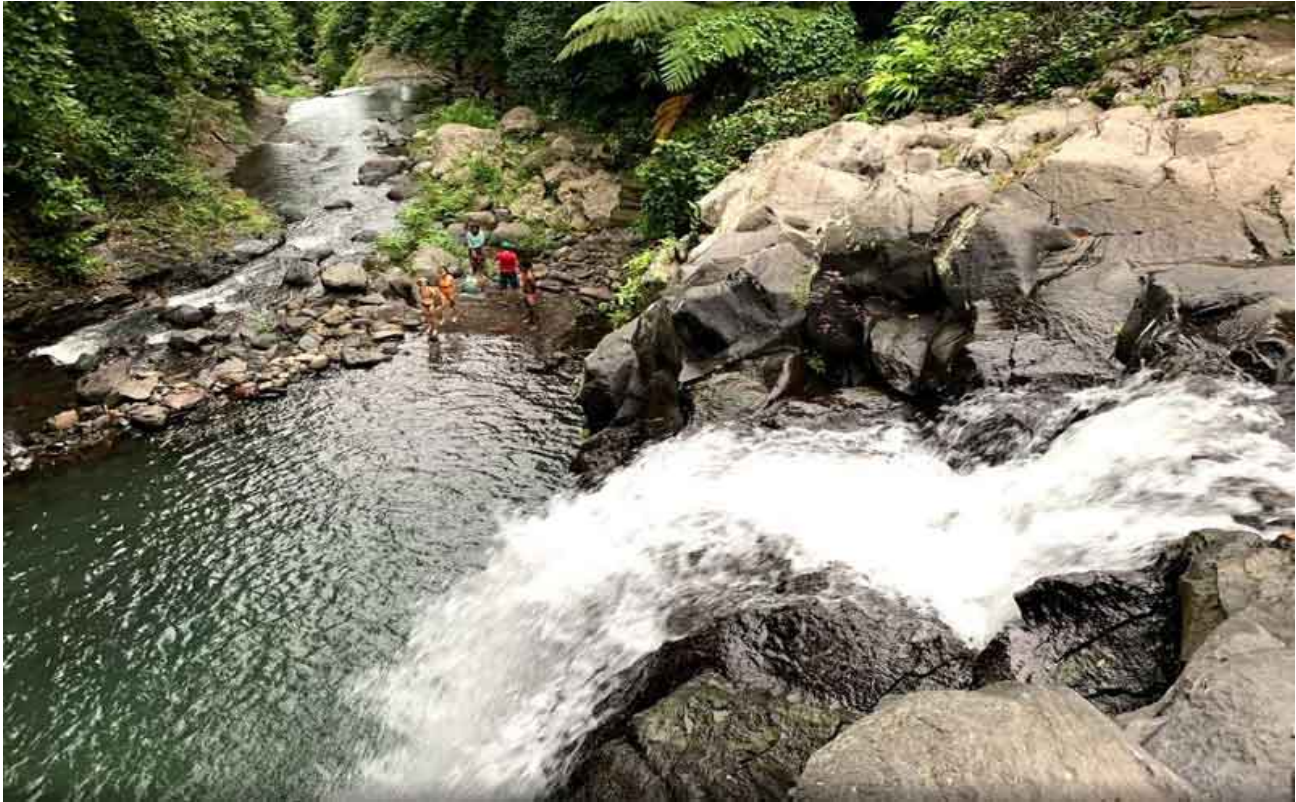
Waterfall North Bali Jumping Tour

Not only that, natural scenery around point will also spoil your eyes during enjoying activity. In order not to lose much those fun moments, you should remember to bring a waterproof camera to take all images.