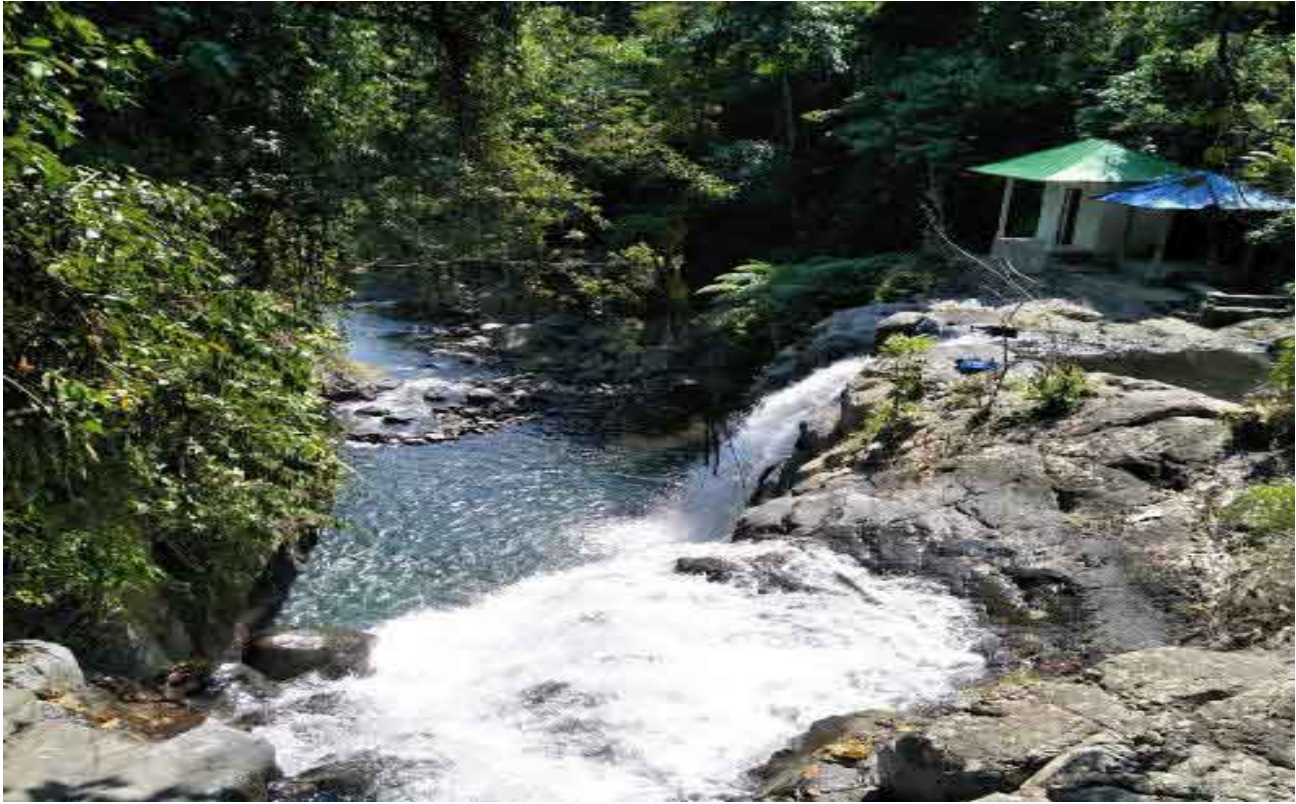
Waterfall Cliff Jumping Bali

That waterfall maybe you haven't ever heard! However, it is increasingly in demand for its soothing natural view Point that be offered.