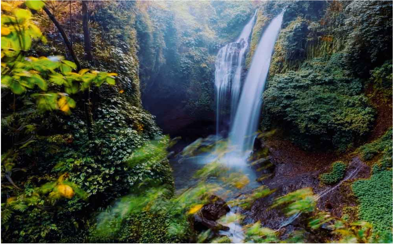
Best Waterfall Tours in Bali