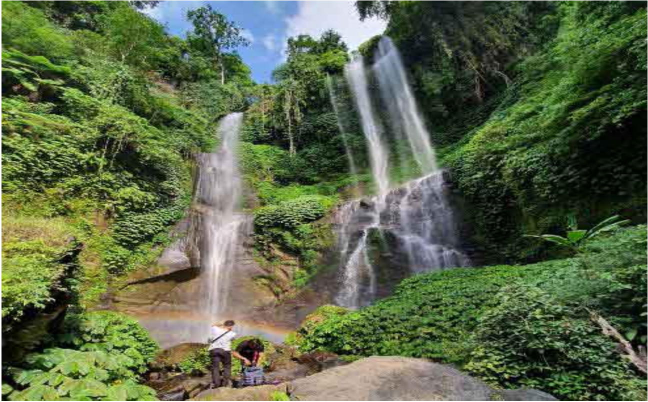
Secret Waterfall Tour Bali