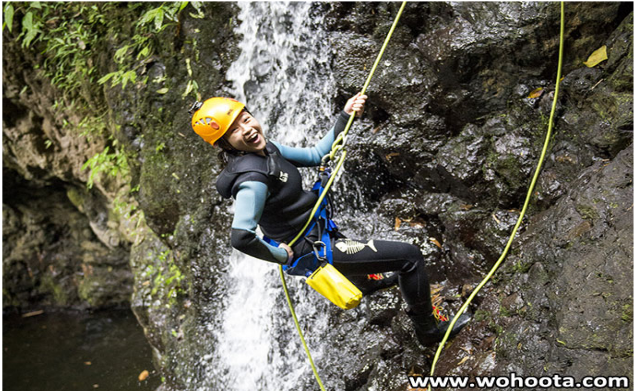
Kalimudah Canyon Bali

In order to get safe and fun experience, you should bring: