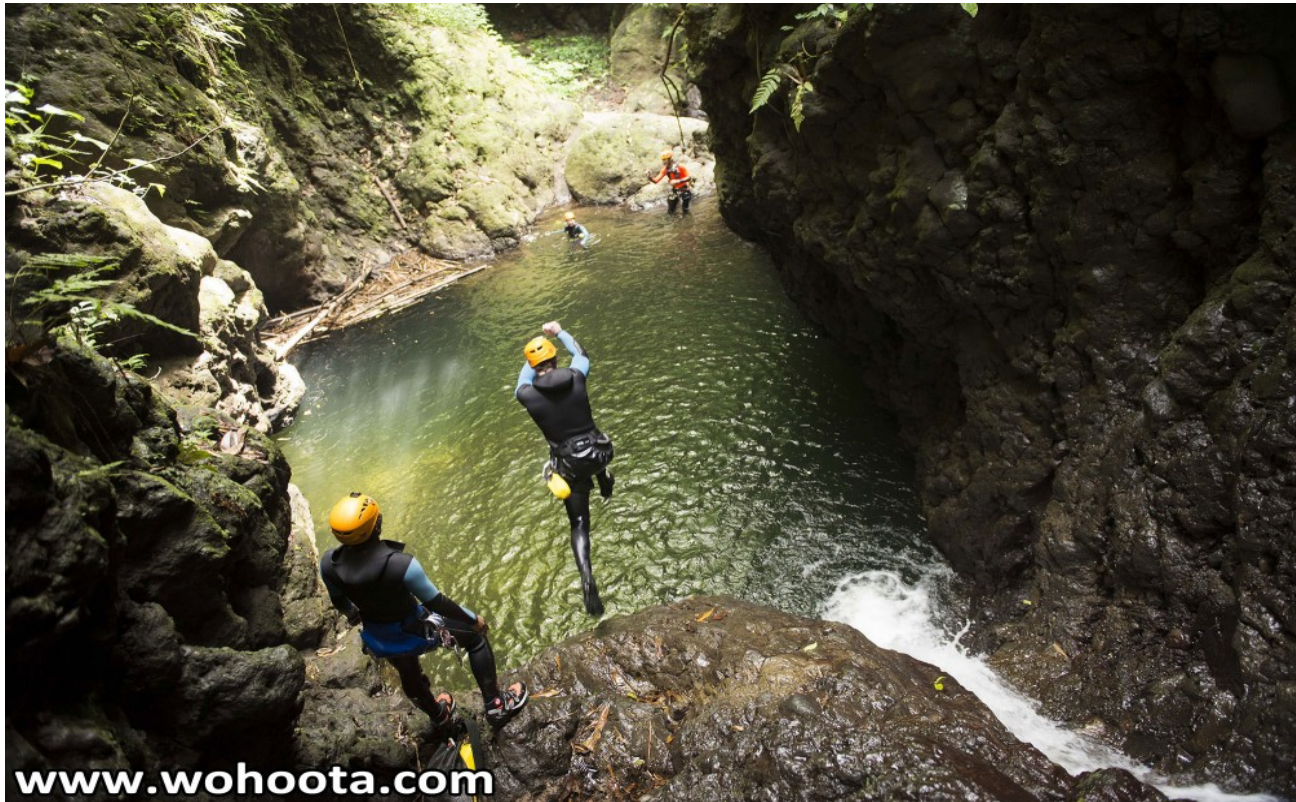
Canyoning North Bali

The facilities-facilities we offer, include: