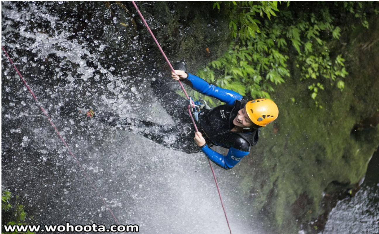
Canyoning Bali Adventure

Especially for you have no experiences in canyoning but really want to try this adventure. Kalimudah Canyon is a good spot to get that opportunity.