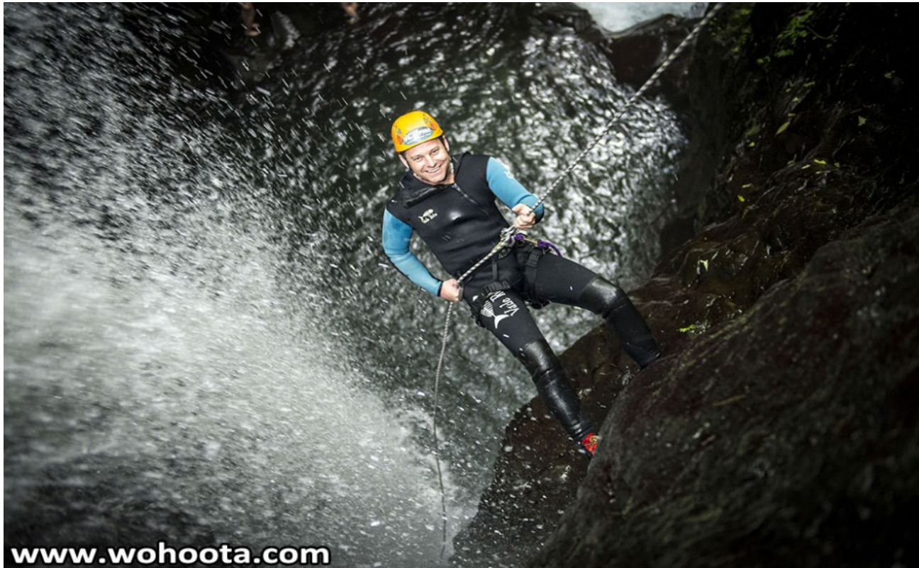
Canyoning Bali Gitgit

What the fun will be offered? Although Kalimudah is categorized as level to beginner. However, all which be provided is tremendously complete, including the following!