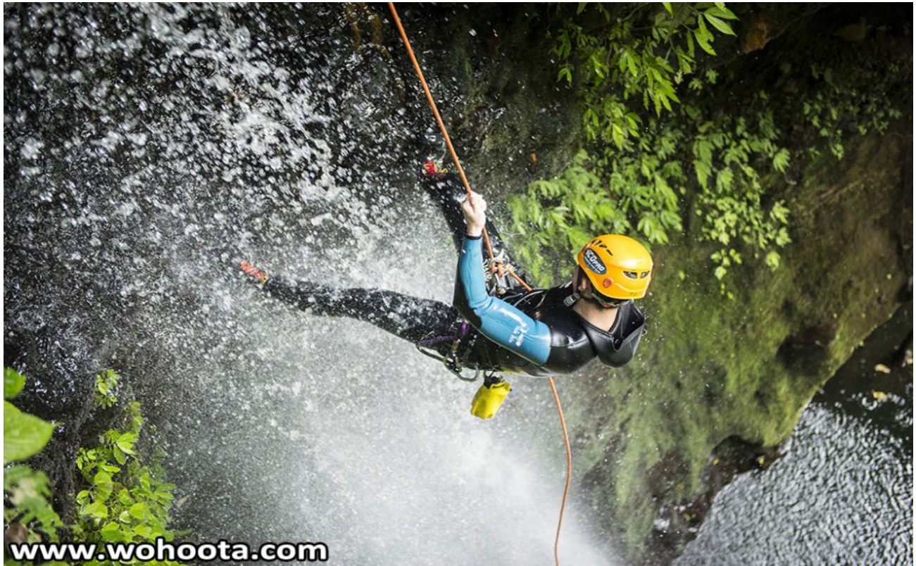
Canyoning Bali Kalimudah

This Canyoning trip in Kalimudah will take time for full day. Where it will include: