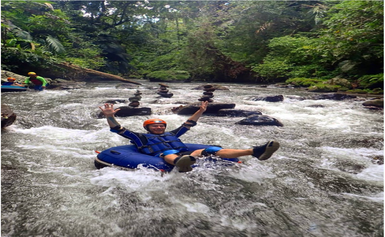
A tubing group tour in Bali River