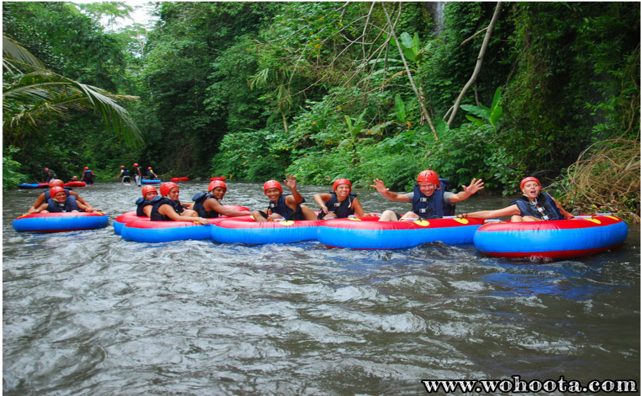
Tubing Adventure at Pakerisan River Bali

Pakerisan River is a tubing spot that located in Tampaksiring Area, Gianyar Regency. The spot is about 4.5 kilometers or approximately 1.5 hours to finish.