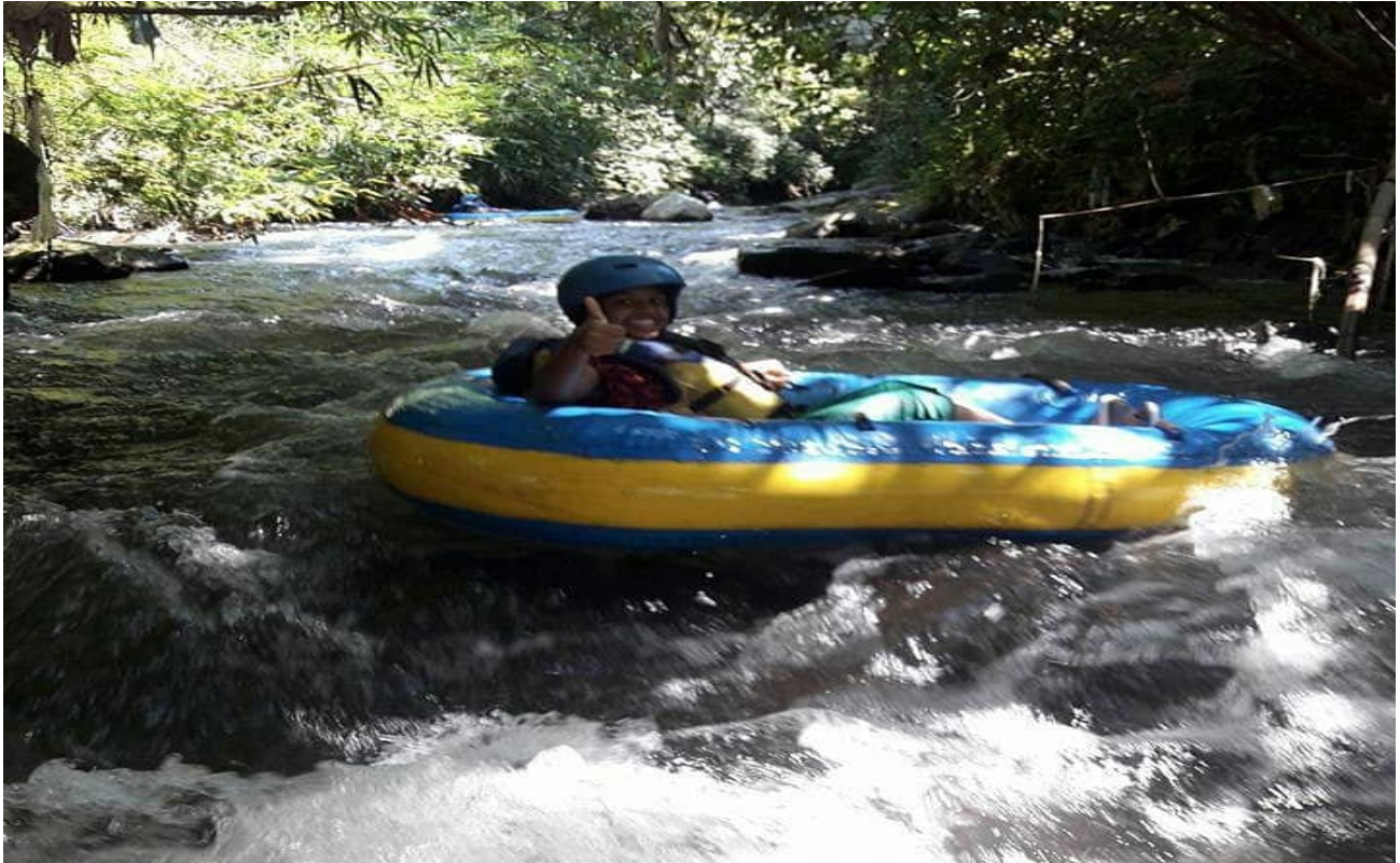
Adventure of Tubing along Bali River - @balitubing

Tubing in Bali isn't as well-known as rafting activity hence its spots are a little. The following are a few good river spots that you may try in Bali, namely: