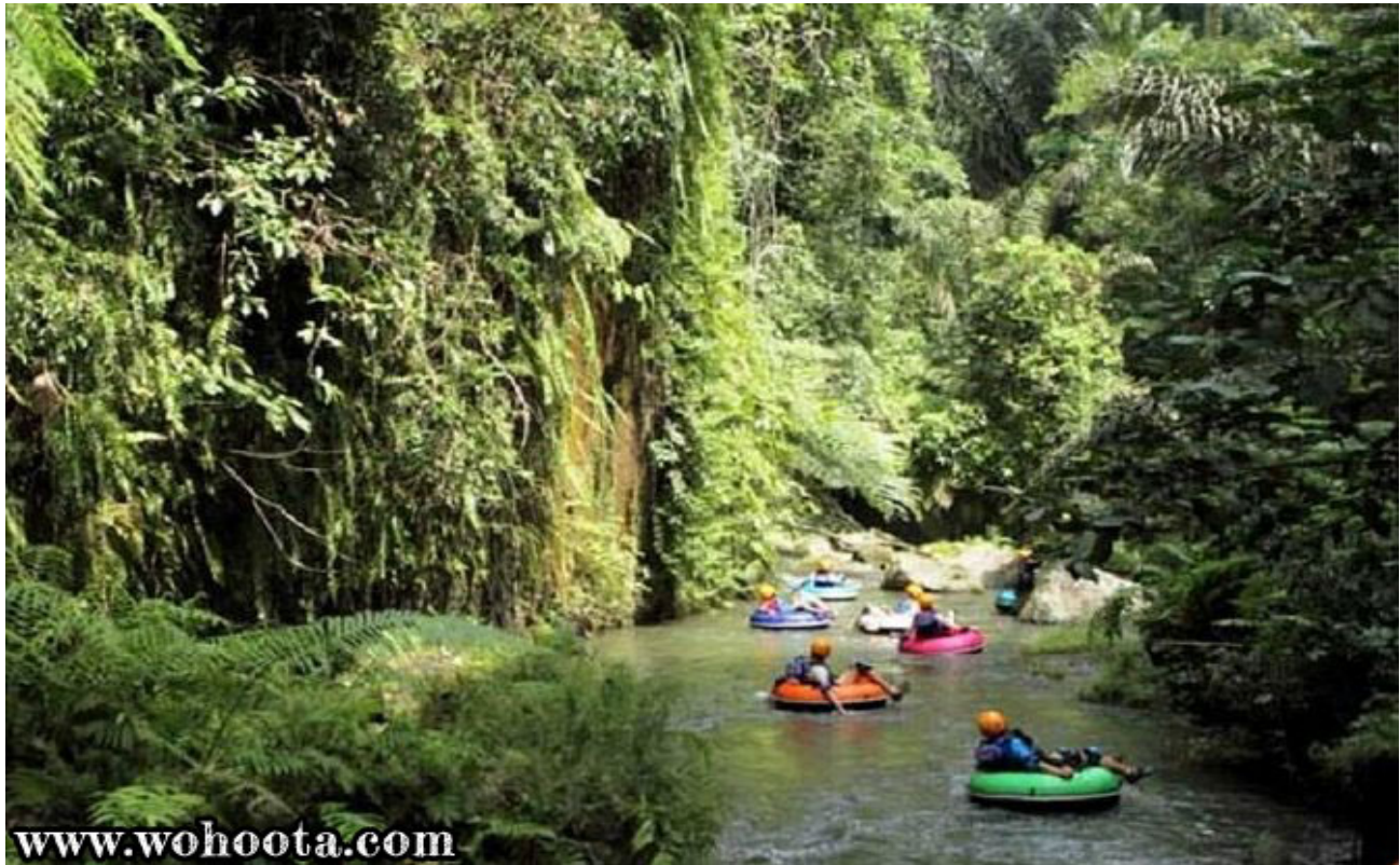
Tubing Adventure at Yeh Penet River Bali

Yeh Penet River is a spot that located at Tanah Wuk, Sangeh, Badung Regency. The spot is about 3.5 kilometers and need approximately 1.5 hour – 2 hours from start to finish.