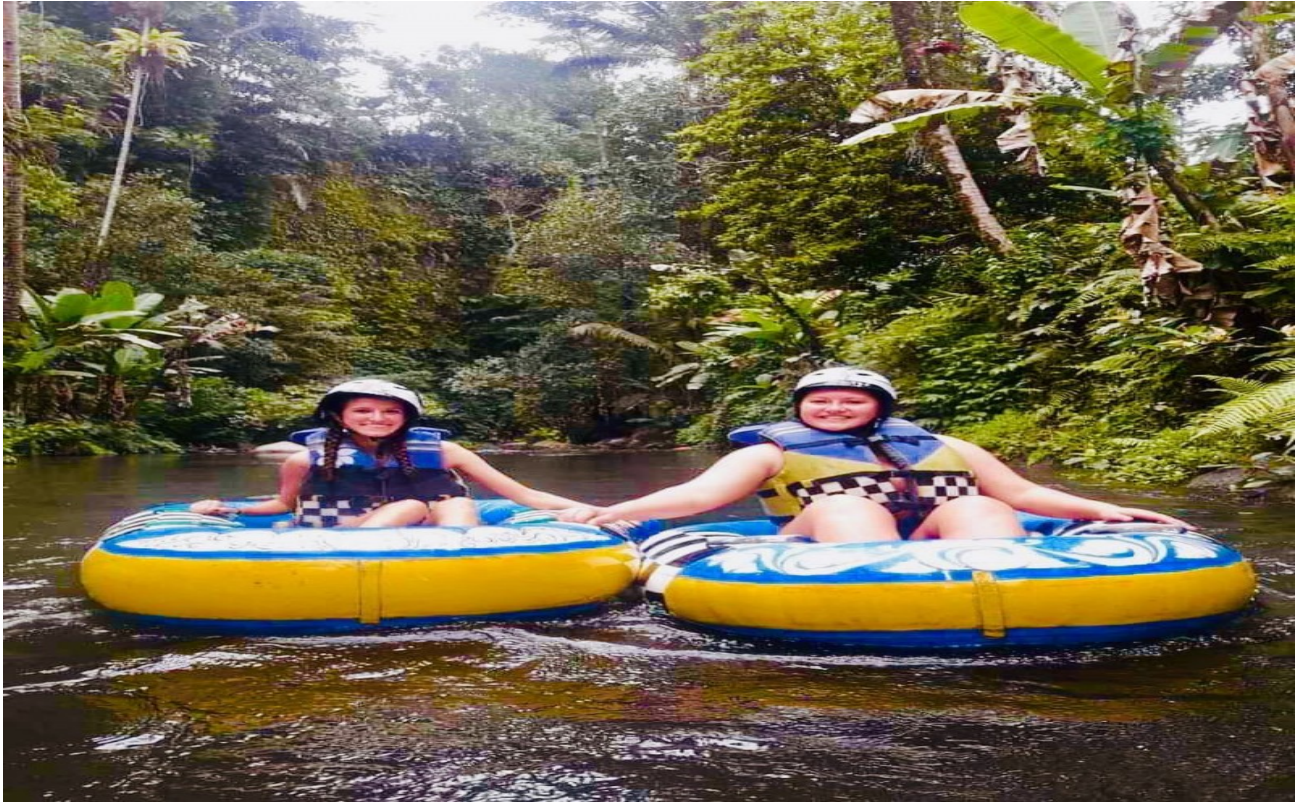
River Tubing in Bali Wilderness - @therealslim_cheney

Price of tubing tour packages in Bali range from IDR 650.000 for adults and IDR 520.000 Children (7 - 12 years).