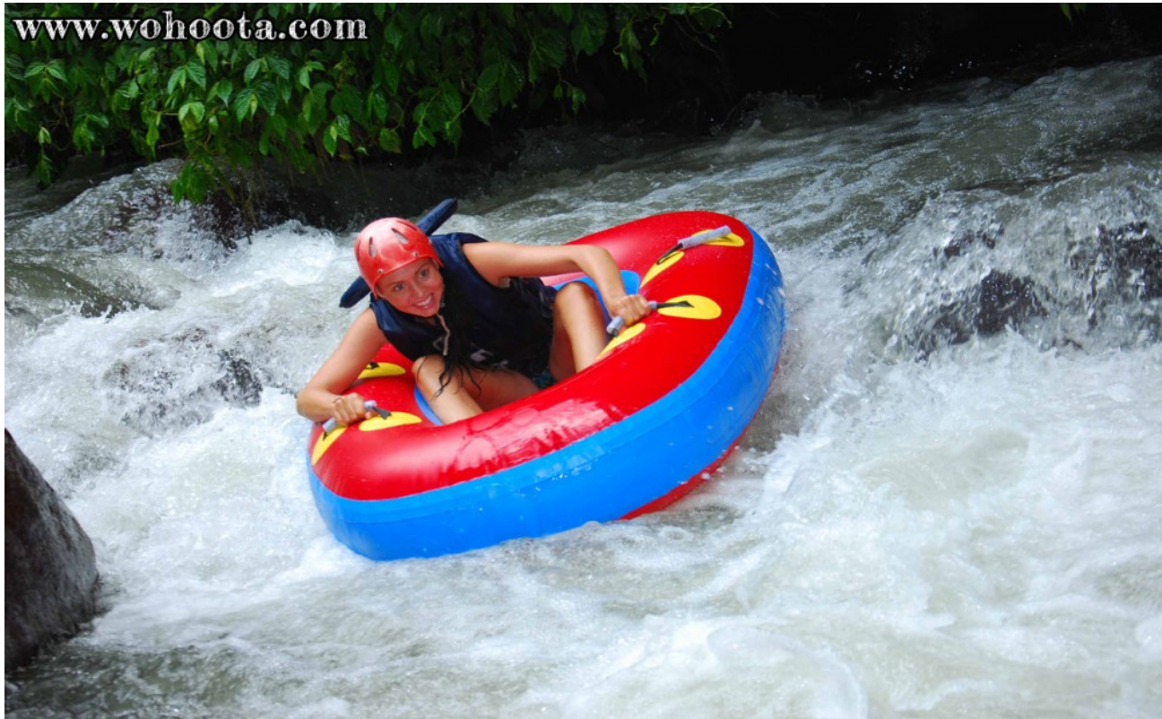
Tubing Adventure at Bali Ayung River

Ayung River is another spot that located in Ubud Area, Gianyar Regency. The spot is about 11 kilometers and need approximately 2.5 - 3 hours from start to finish.