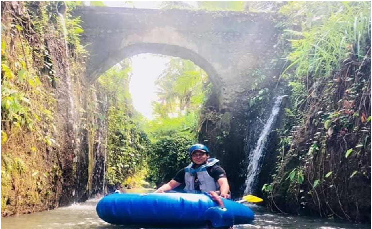
Beautiful Route of Bali Tubing Tour - @prie_a_biranta

For getting safe and fun experience, there is a preparation that you should bring from home such as: