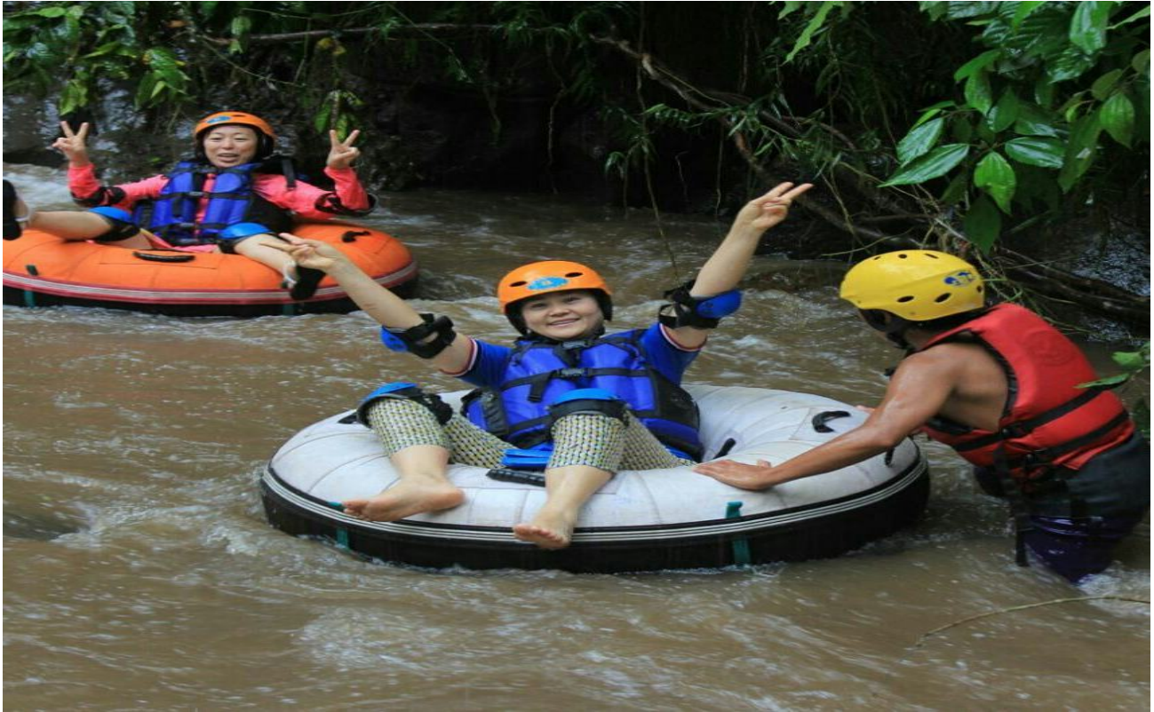
Participants with Guide in Bali Tubing Tour - @bioadventurer

As rafting, there are some equipment that need to apply when navigating along the river. The equipment are: