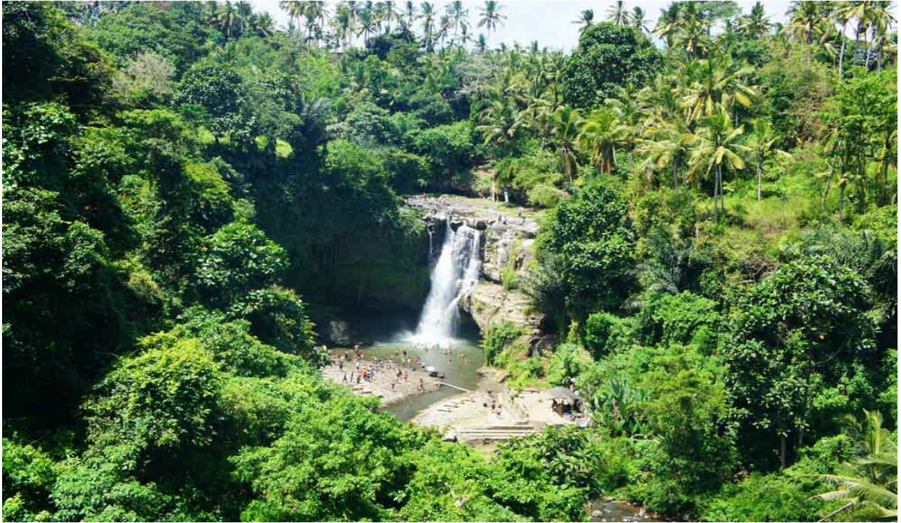
Tegenungan Waterfall Parking Area

Entrance Ticket Fee in Tegenungan is really cheap, just IDR 10.000 per person. The parking area is wide enough.