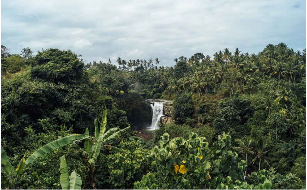
Amazing Tegenungan Waterfall

The access to Tegenungan Waterfall is much easier than Waterfall Points in North Bali. After going pass many stalls near parking area, it's time to walk down a hundred the stairs. It's very good and easy to go through because it was built by concrete.