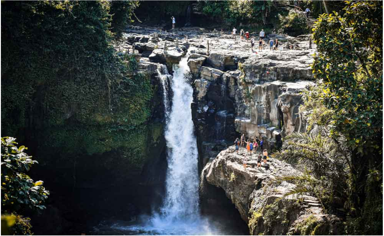
Tegenungan Waterfall Location

The waterfall is located at Ir. Sutami Street, Kemenuh village, Sukawati District, Gianyar Regency. The situated to waterfall is easy and smooth.