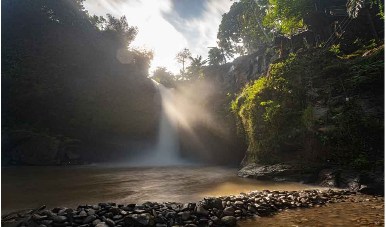
Holy Shower of Tegenungan

Tegenungan Waterfall is generally opened at 06.30 - 18.30. If you plan to visit, at the afternoon is best time. Many visitors also always this time to come.