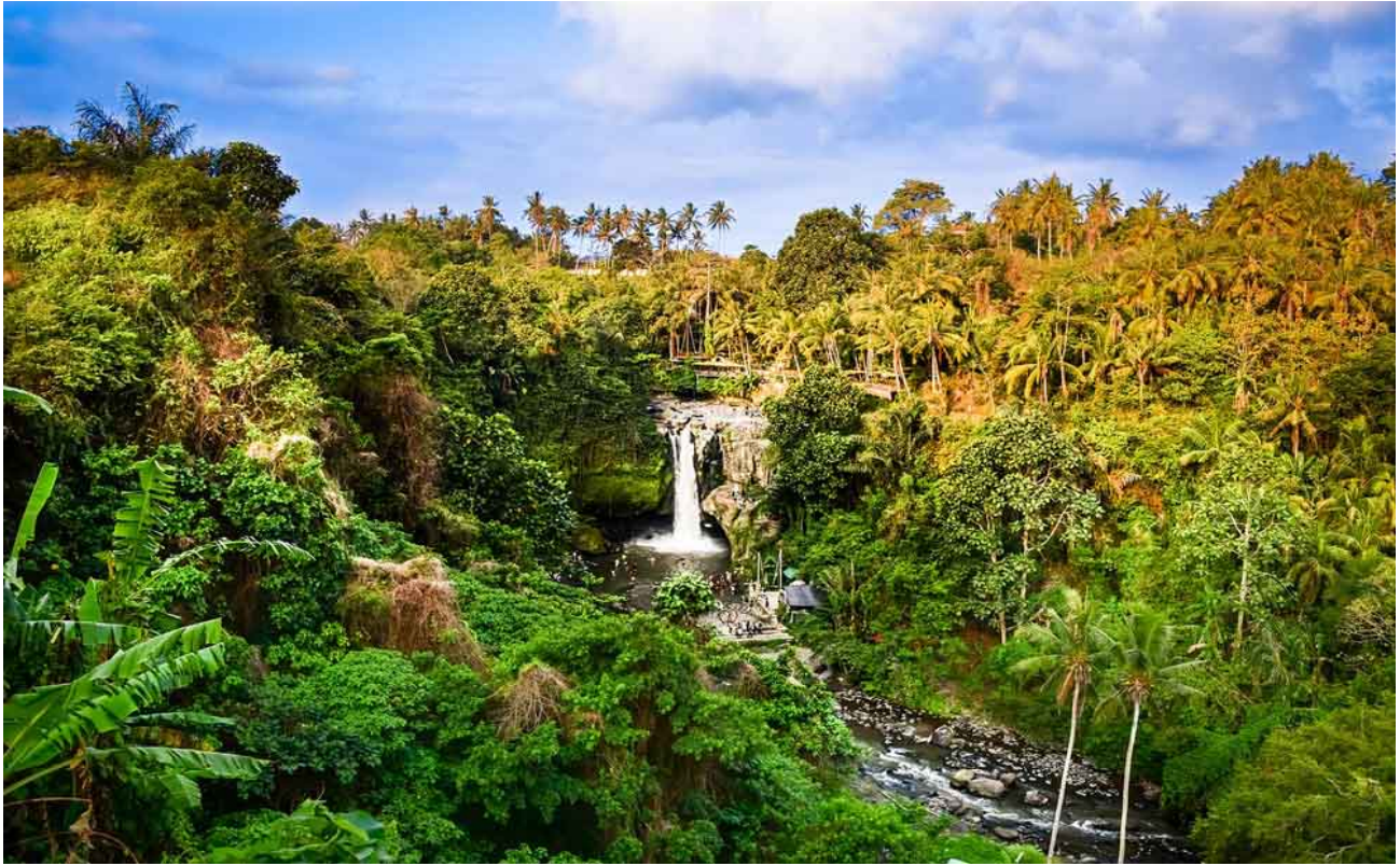
Ubud Tegenungan Waterfall

Bali Tegenungan Waterfall features the lush scenery of water roar from 20 meters height. Great rock cliff seems like flanking Heavy Water Flow. It is really awesome if you look from far.