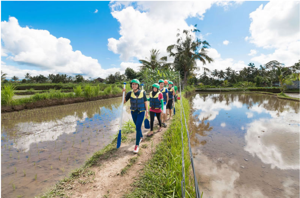
The Rafters to Ayung River Spot

Conquer the challenging obstacles while seeing the stunning panorama are surely a memorable fun experience that you get there.