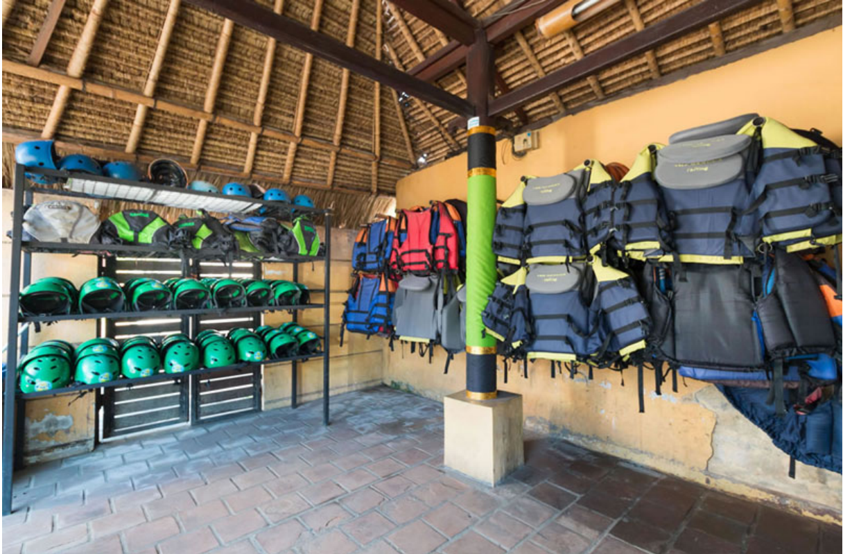
Safety Equipment in Ayung Rafting Adventure Ubud

Besides safety equipment and guide, there are some other facilities to support your experience which include in tour package. The facilities are a locker, a shower room, lunch, and insurance.