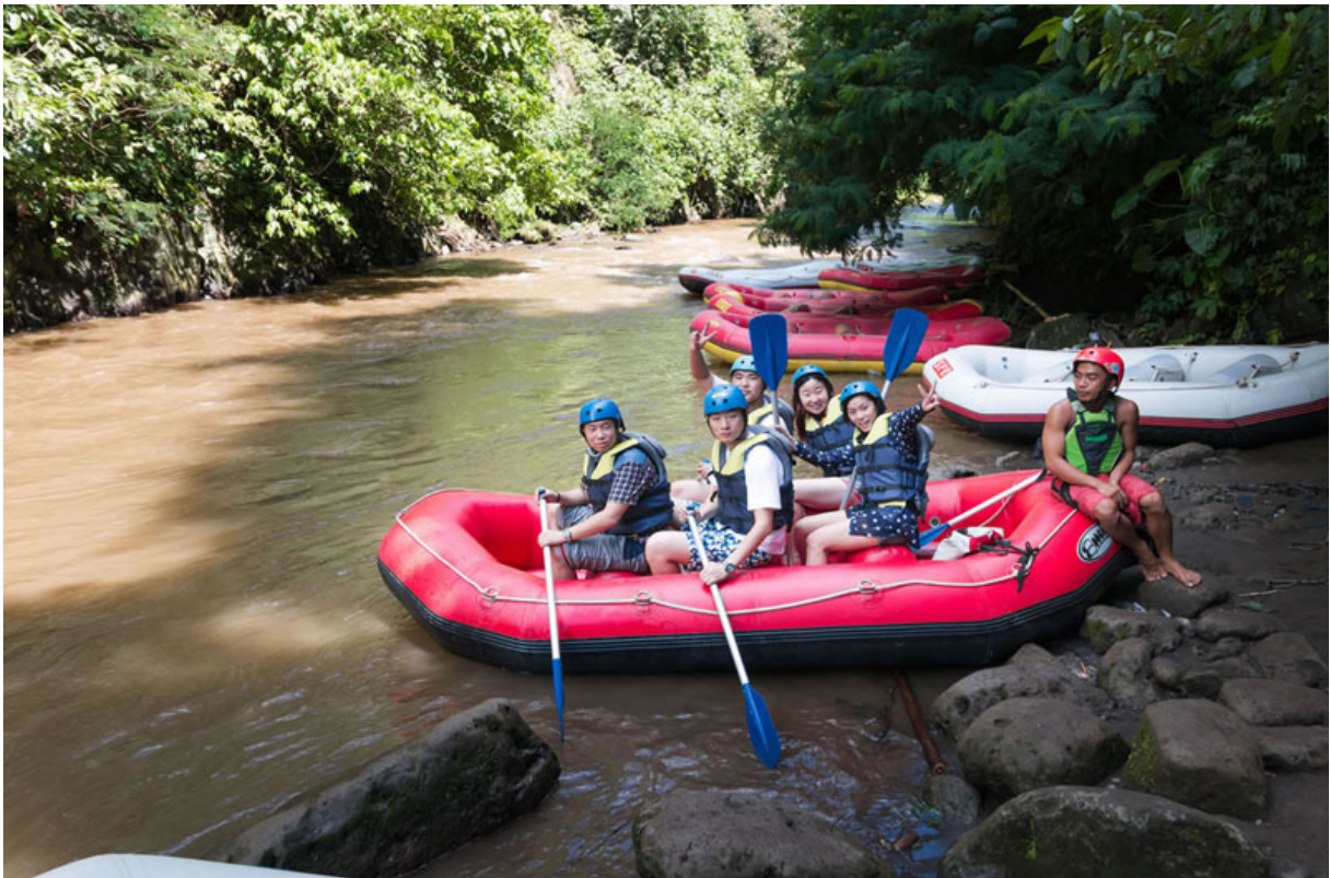
Bali White Water Rafting River

Perhaps you are a novice (have no experience) in both adventures above and get a trouble in a track. Don't worry about it because we have some professional guides to accompany your adventure.