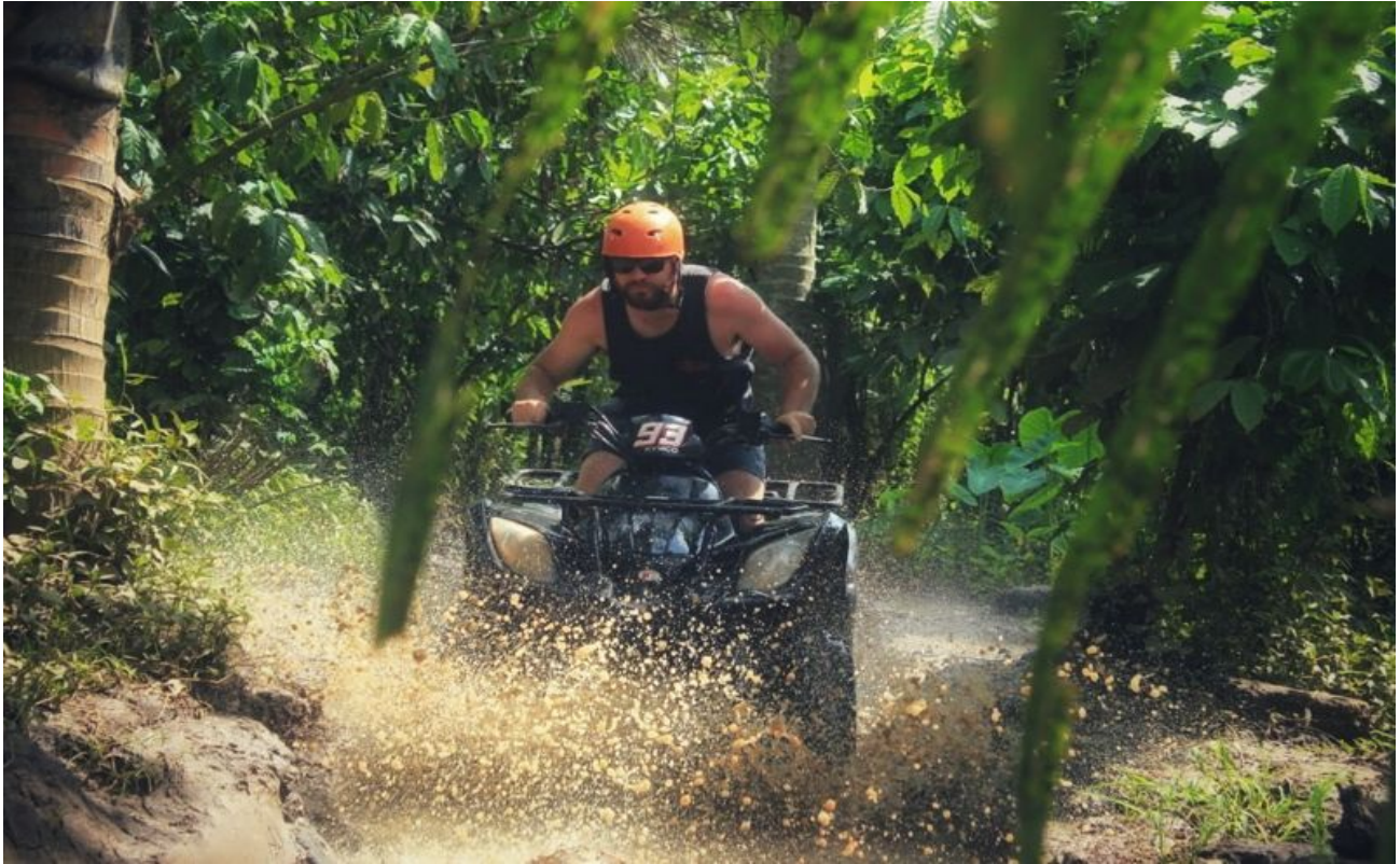
Atv Riding Bali

Each tour package above usually includes supporting facilities and services as: