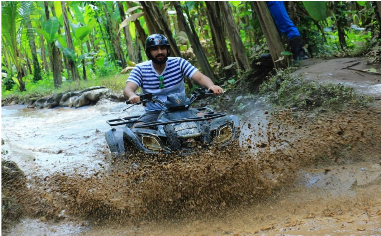
Conquering Muddy and Wet Track in Bali ATV Adventure

In general, the adventure of Adventure usually takes route along wet, muddy, steep tracks.