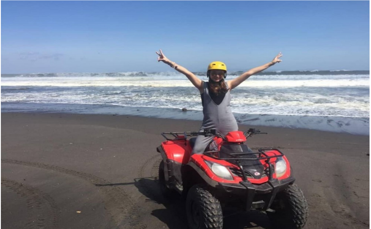
Beach Point of Bali Quad Bike

Aussies Bali Adventure is located in Tabanan Regency. It features awesome tracks such as remote black sand beach, rice fields, jungle tracks and traditional local villages.