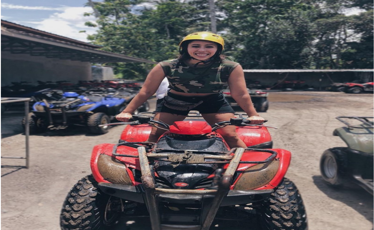
A Rider on Quad Bike

The operators of atv tour in Bali mostly offers 2 kind of package choices, namely: