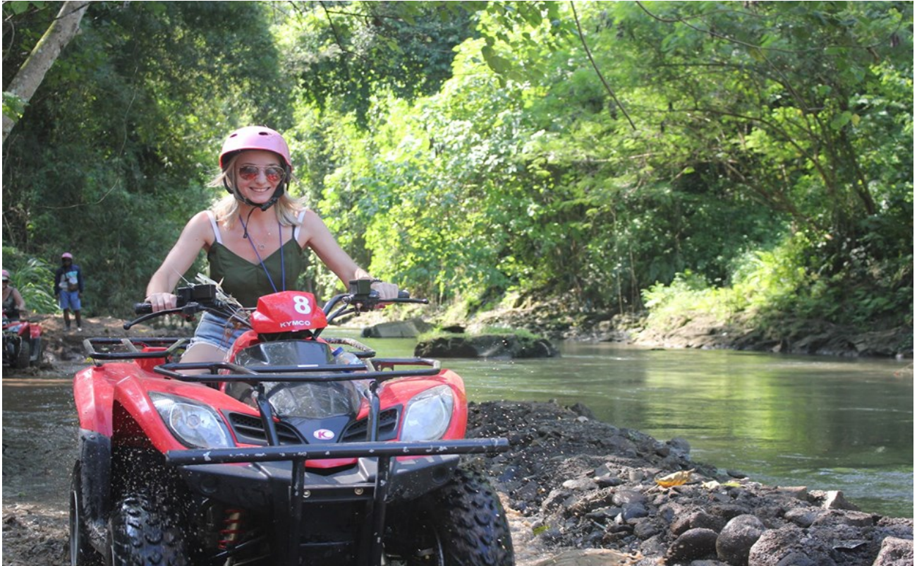
Bali Atv Riding at Bali Beji River Adventure

Bali Beji River is also located in Silakarang, the southern of Ubud. It offers challenging atv tracks such as: a forest, river track, and traditional village.