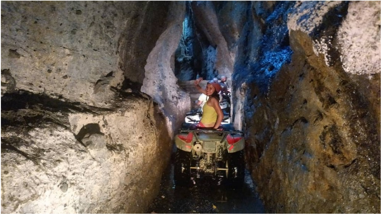
Riding ATV at Bali Cave - Photo by @eripalgunadi

Kuber Bali Adventure is being in Payangan village, the northern of Ubud. It features atv adventure tour with amazing tracks namely: small forest, waterfall, and cave (tunnel).