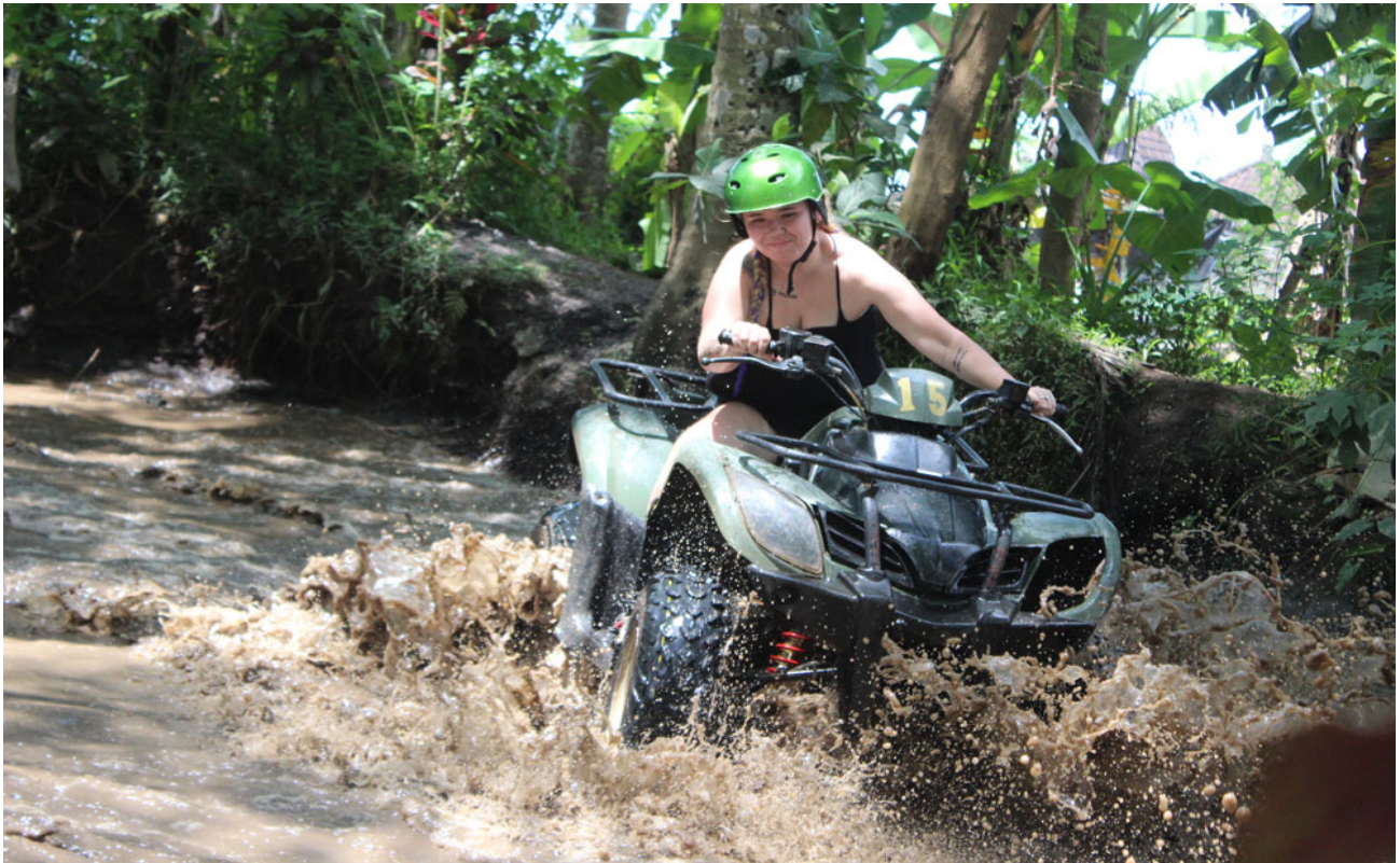
ATV Adventure at Bali Green Adventure