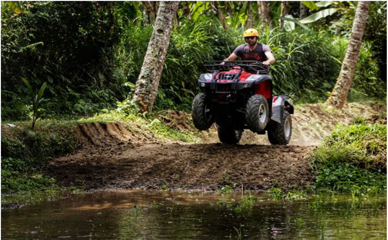
Bali Quad Bike Adventure

For having a fun tour experience, you should prepare some proper items before go adventuring. The preparation is as: