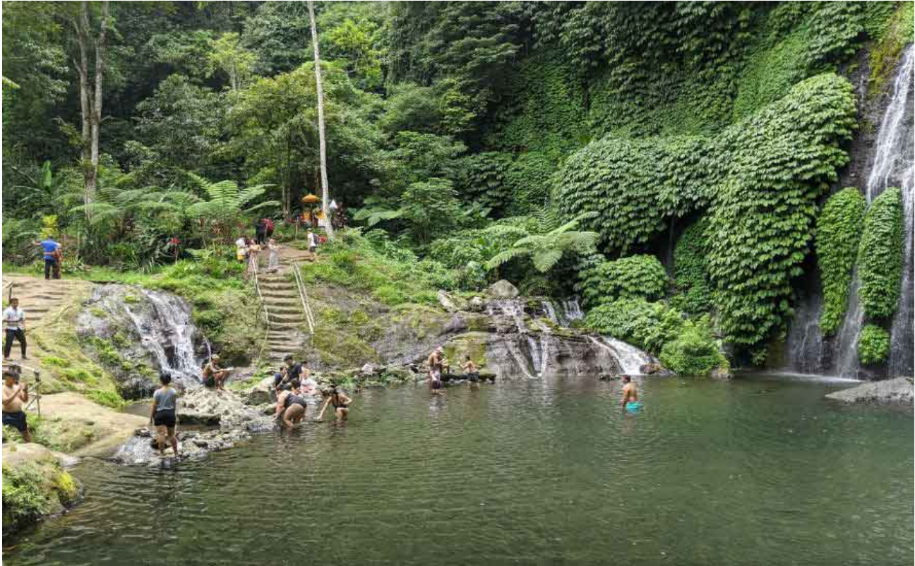
Hidden Waterfall Tour Bali