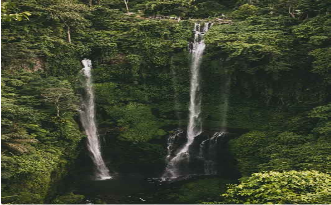
Sekumpul Waterfalls Singaraja Bali

All these will surely create many fun and memorable memories for your holiday in Bali. Let's have Amazing Tour with Wohoota .